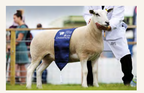
LLEYN C&C Crawford