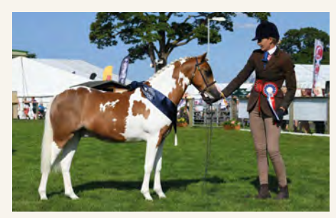
COLOURED HORSE & PONIES IN HAND Nicoll Show Team Withymead Captain Crunchie