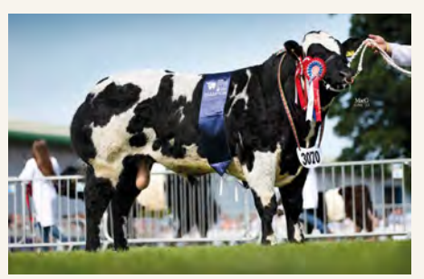
BRITISH BLUE Alastair Jackson Topgun Splash