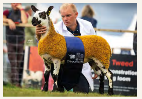
BLUEFACED LEICESTER -CROSSING TYPE RJ Shennan & Son