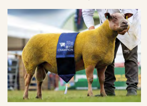
BRITISH ROUGE JE Teasdale