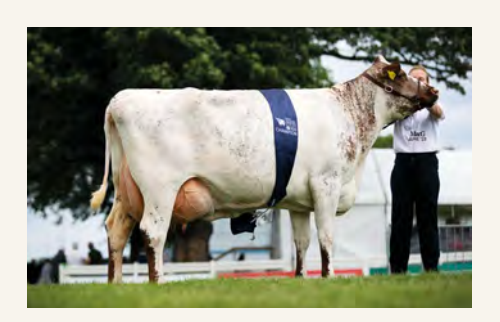
DAIRY SHORTHORN North Cassingray Lisnamulligan Royal Kathleen 2