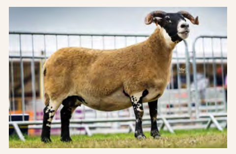
BLACKFACE A MacGregor (Allanfauld) Ltd