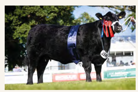
ABERDEEN ANGUS M Alford Blelack Princess Carina X125