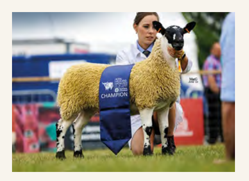
SCOTCH MULE A MacGregor (Allanfauld) Ltd