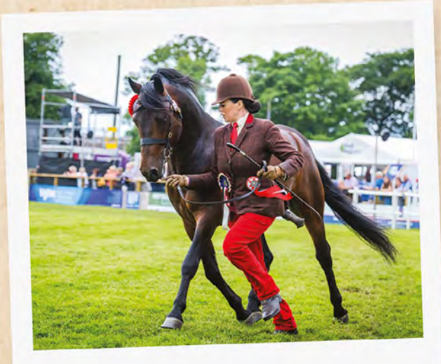
Showing competitors in the main ring