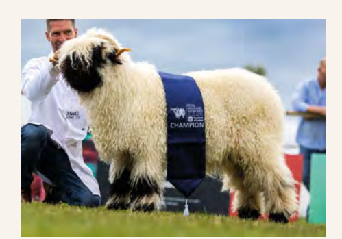
VALAIS BLACKNOSE Hardens View