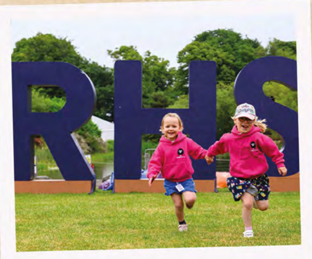
Over 26,000 children attended for free