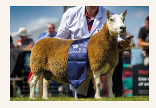
CHEVIOT W.J. Douglas & Son