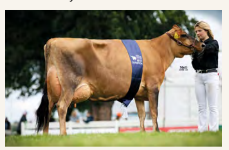
JERSEY Cowhill Trust Kerricks Dakota Belle