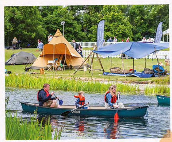
Taking it easy in the Countryside Area of the Showground