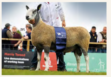
BLUEFACED LEICESTER -TRADITIONAL TYPE Strang Steel, Philiphaugh