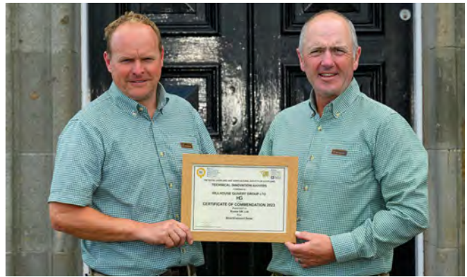
A Commendation was awarded to Krone UK Ltd for the SmartConnect Solar . The SmartConnect Solar is a self-sufficient telemetry unit that integrates simple machines into a digital data management system.