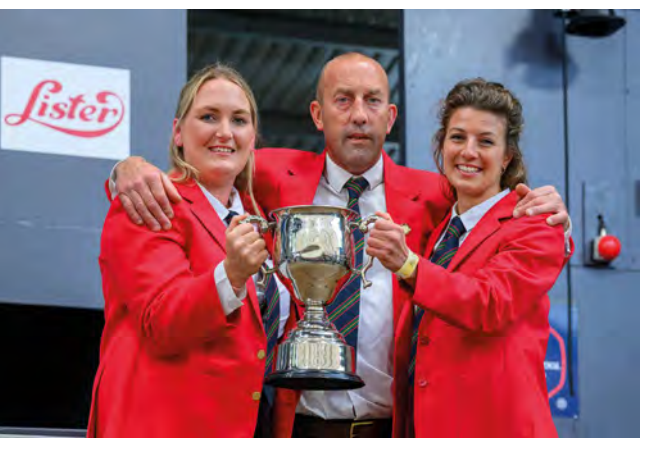
WALES FOR WOOL HANDLING