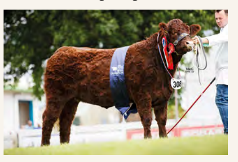
SALERS Traboyack Salers Lisnamaul Rebecca