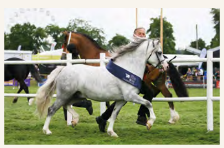
WELSH PONY SECTION A Mrs V Dyvig Sunwillow Xspo