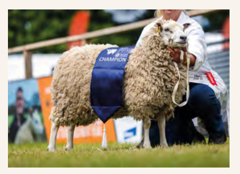
SHETLAND Kate Sharp