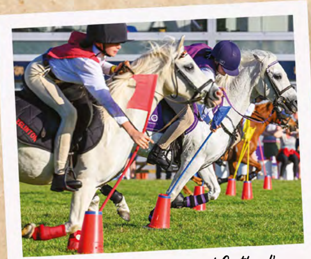
Skill and speed on display at Scotland's largest equestrian event