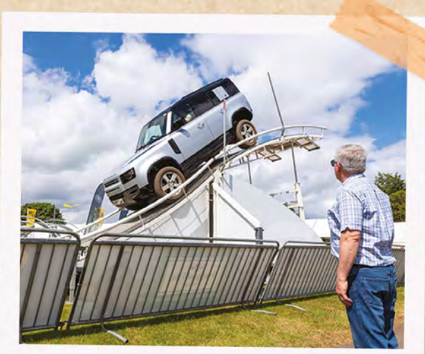
The land Rover Experience was popular with visitors