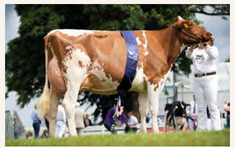
BRITISH RED & WHITE B&M Yates Dice Kiwi Red