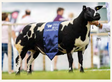
DUTCH SPOTTED Rigghead Farm