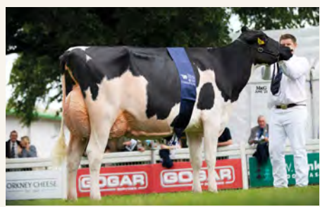
HOLSTEIN B&M Yates Eedy Crushabull Acclaim