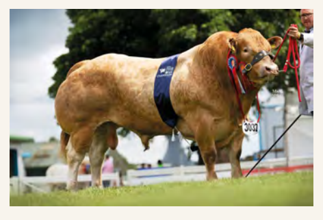
BRITISH BLONDE Thor Atkinson Broccagh Kingfisher