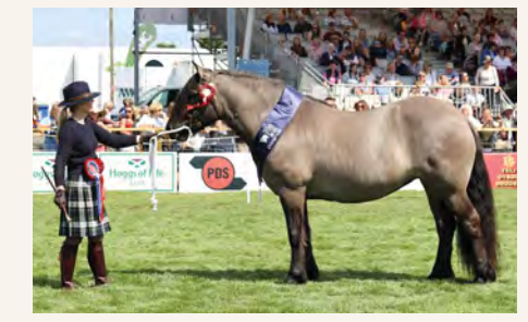
HIGHLAND PONY FEMALES Heather Kerr Tower Victoria