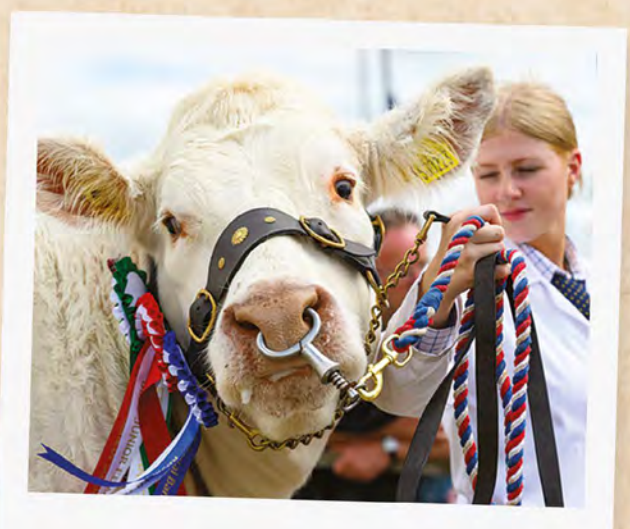
A winner in the Charolais class