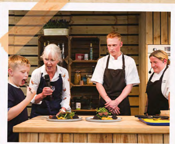
The Food for Thought Cookery Theatre hosted professional chef demos