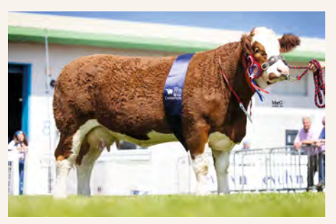
BRITISH SIMMENTAL R&A Simmers Annick Ginger's Lucia