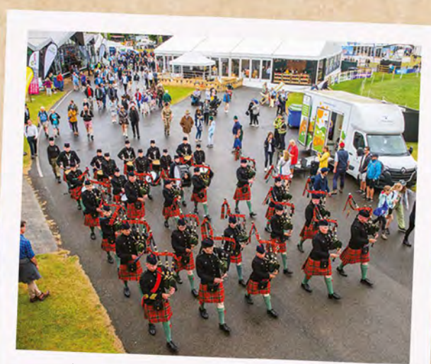
A showcase for Scottish culture over the four days of the Show