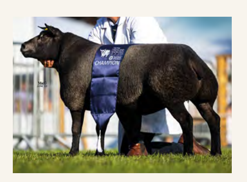
BLUE TEXEL Shortt & Donaldson