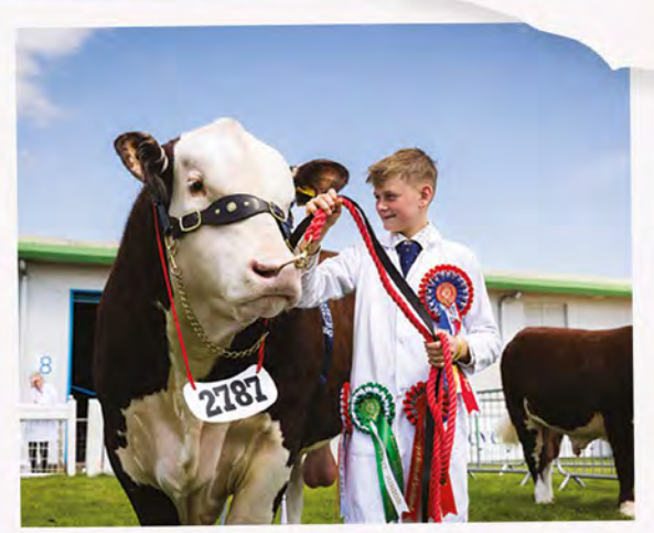
A young handler in the ribbons with their Hereford