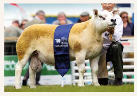
TEXEL Procters Farm Ltd