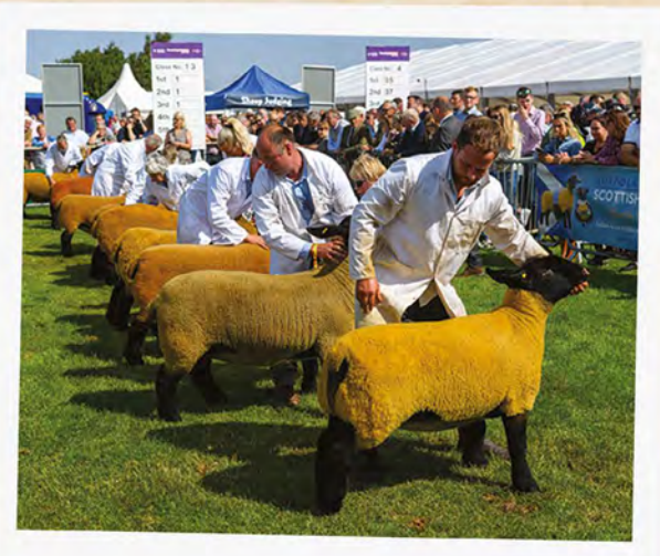
Suffolks line up to be judged