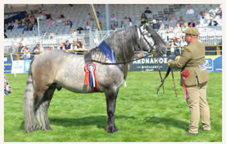
HIGHLAND PONY MALES & HIGHLAND PONIES IN HAND OVERALL Mr C Grant