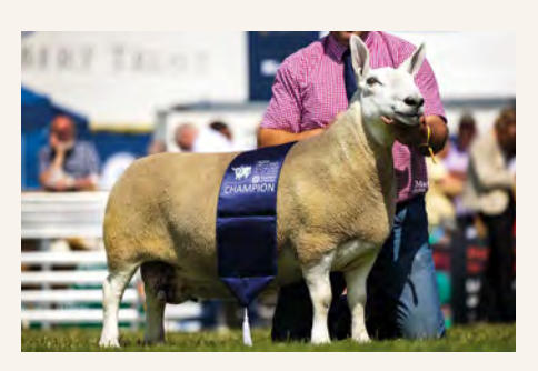
NORTH COUNTRY CHEVIOT W&J Thomson