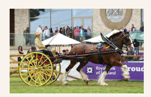
HEAVY HORSE TURNOUTS Hugh Ramsay Yorkie