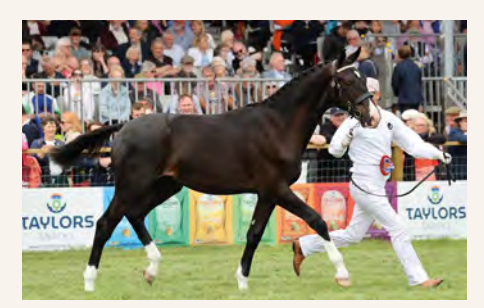
SPORT HORSES IN HAND Fenston Stud Florian Von Faustinus