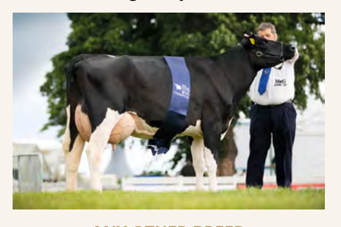
ANY OTHER BREED North Cassingray Lismulligan Honeyschaap