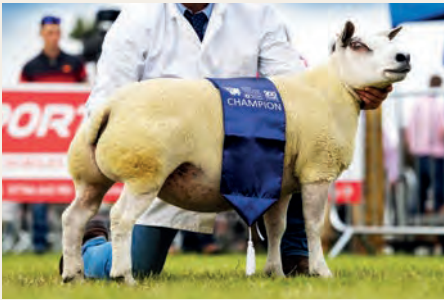
BELTEX R E Wood and Sons