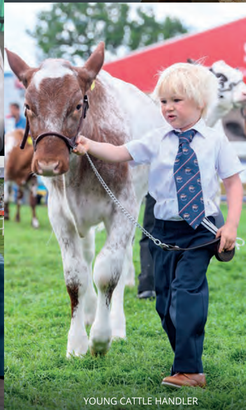
YOUNG CATTLE HANDLER