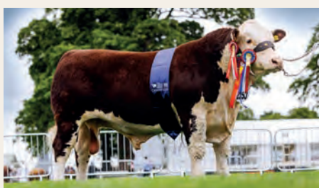
HEREFORD SC and GL Hartwright Spartan 1 Typhoon