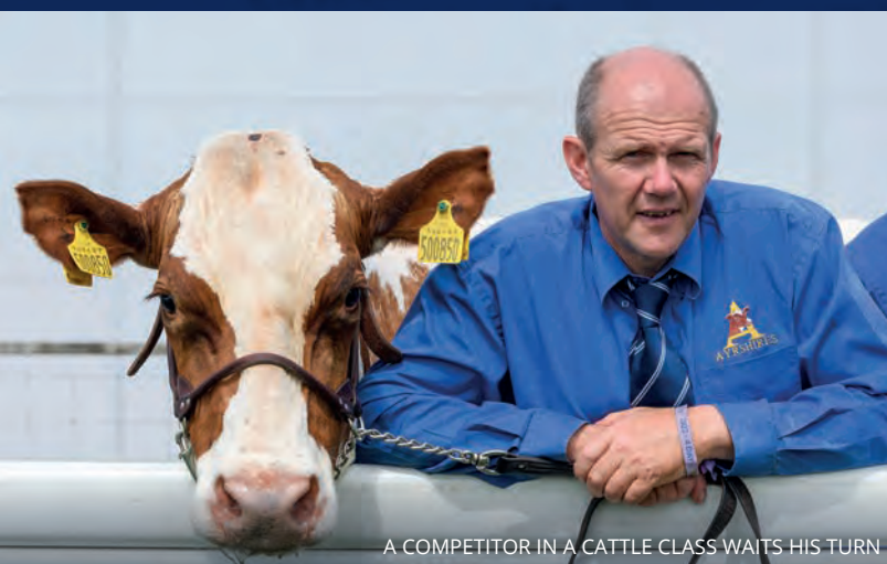
A COMPETITOR IN A CATTLE CLASS WAITS HIS TURN

The success of this very special bicentenary Highland Show is a testament to the hard work of the hundreds of staff and RHASS Directors who work tirelessly to put on this incredible event – one that's loved equally by the farming community and urban audiences.