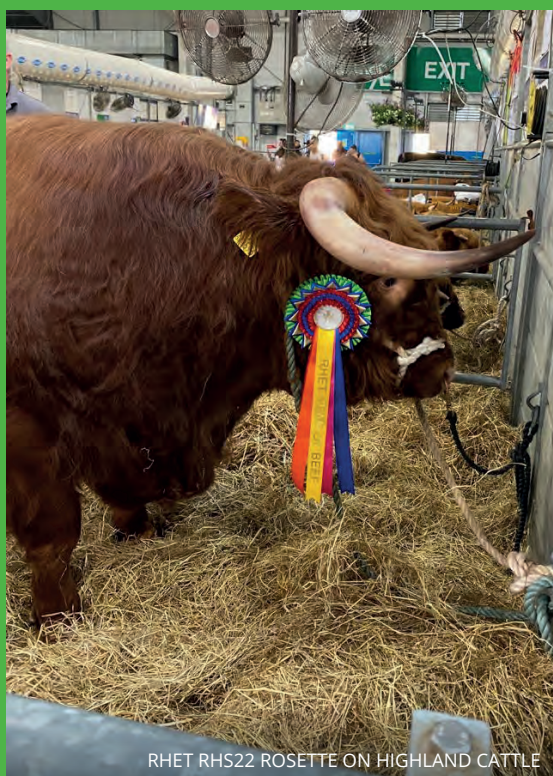
RHET RHS22 ROSETTE ON HIGHLAND CATTLE