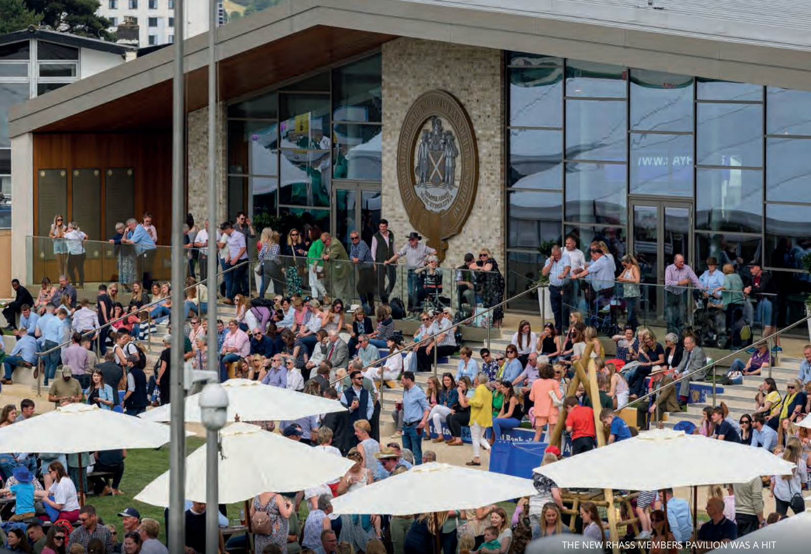
THE NEW RHASS MEMBERS PAVILION WAS A HIT