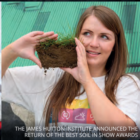
THE JAMES HUTTON INSTITUTE ANNOUNCED THE RETURN OF THE BEST SOIL IN SHOW AWARDS