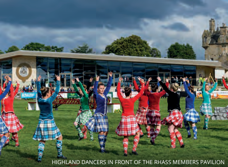
HIGHLAND DANCERS IN FRONT OF THE RHASS MEMBERS PAVILION