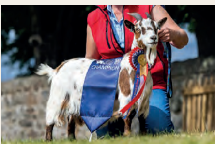
PYGMY GOATS Aylswood Rare Breeds Brucklay Harmony