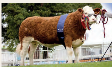
BRITISH SIMMENTAL R and A Simmers Islavale Lullaby