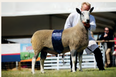
BLUEFACED LEICESTER - TRADITIONAL TYPE RA McClymont & Son