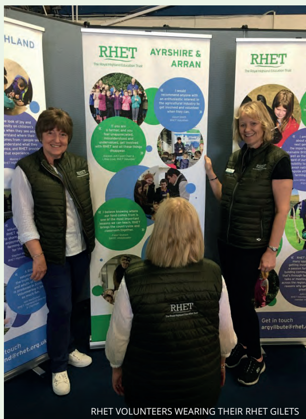
RHET VOLUNTEERS WEARING THEIR RHET GILETS

Inside the Discovery Centre this year, RHET was grateful to have the support of several education partners.