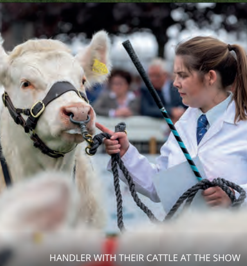
HANDLER WITH THEIR CATTLE AT THE SHOW