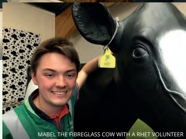
MABEL THE FIBREGLOSS COW WITH A RHET VOLUNTEER

Stirling University was also on hand to deliver story telling sessions on waste.