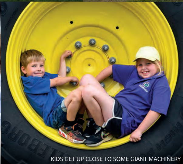
KIDS GET UP CLOSE TO SOME GIANT MACHINERY