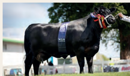
ABERDEEN ANGUS WD Allen Stouphill Quorum