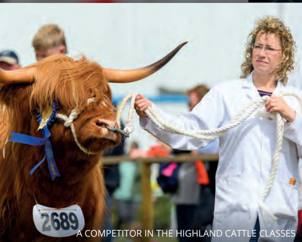
A COMPETITOR IN THE HIGHLAND CATTLE CLASSES