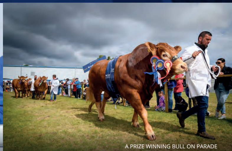
A PRIZE WINNING BULL ON PARADE