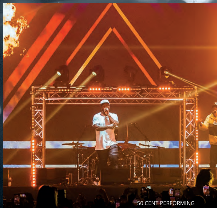
50 CENT PERFORMING

The 8,000-capacity concerts mark the long-awaited return of festival-style music events to Ingliston. The Ingliston showground has a long history of hosting gigs, dating back to the 1970s. In the past, major music acts including David Bowie, Queen, Oasis, Iron Maiden, Duran Duran and Genesis have performed there.