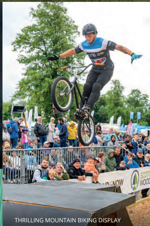
THRILLING MOUNTAIN BIKING DISPLAY