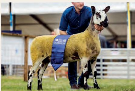
BLUEFACED LEICESTER - CROSSING TYPE J Wight and Sons