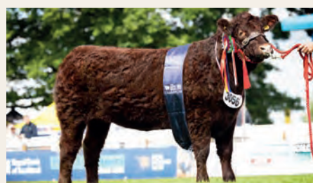
SALER Edgerston Trading Kaimburn Precious