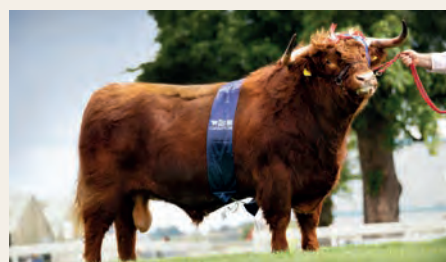
HIGHLAND HM The Queen Gusgurlach of Balmoral