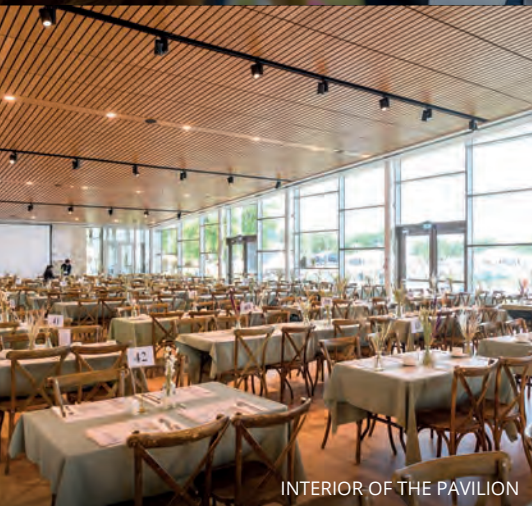
INTERIOR OF THE PAVILION