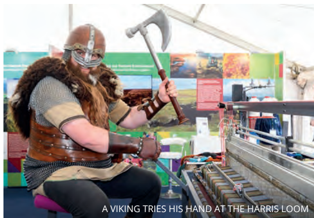
A VIKING TRIES HIS HAND AT THE HARRIS LOOM