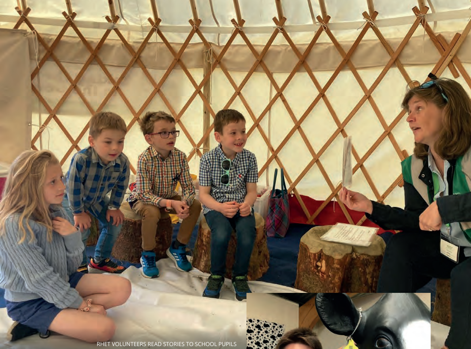
RHET VOLUNTEERS READ STORIES TO SCHOOL PUPILS

RHET is truly grateful to have the support of such a generous network of volunteers, so highlighting their contribution with these new banners was a real pleasure.