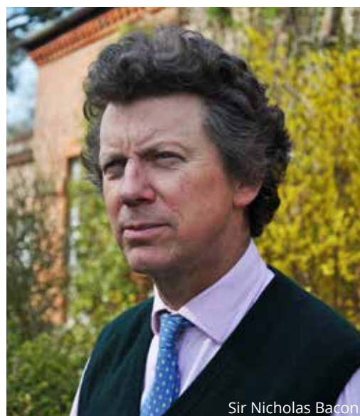
Sir Nicholas Bacon