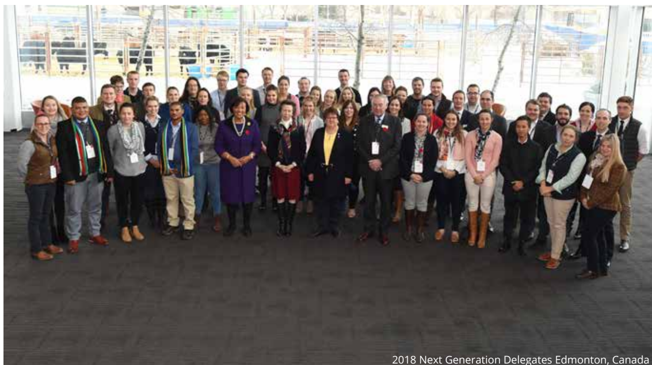
2018 Next Generation Delegates Edmonton, Canada