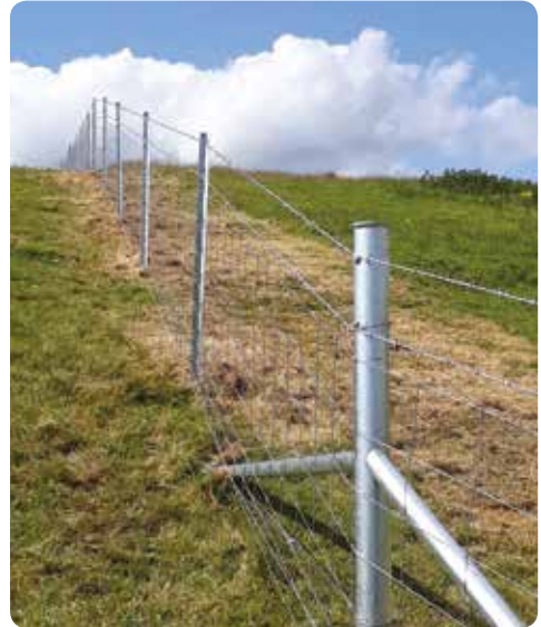
Clipex fencing solution

E very year, RHASS celebrates the outstanding innovation in the industry with its Technical Innovation Awards, presented at the Royal Highland Show.