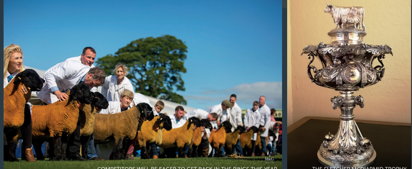
COMPETITORS WILL BE EAGER TO GET BACK IN THE RINGS THIS YEAR

To celebrate the bicentenary, a range of special commemorative rosettes, prize cards, sashes and medals will be awarded this year - including medals with gold finishing, a change from the usual bronze version awarded in other years. The magnificent Fletcher McDiarmid Trophy, an incredibly ornate and historic award, will also return this year to be presented to the Overall Beef Champion.